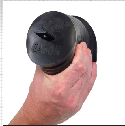
Highly flexible material for easy installation by hand