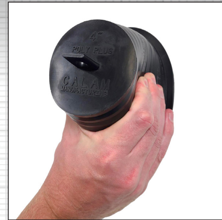
Highly flexible material for easy installation by hand