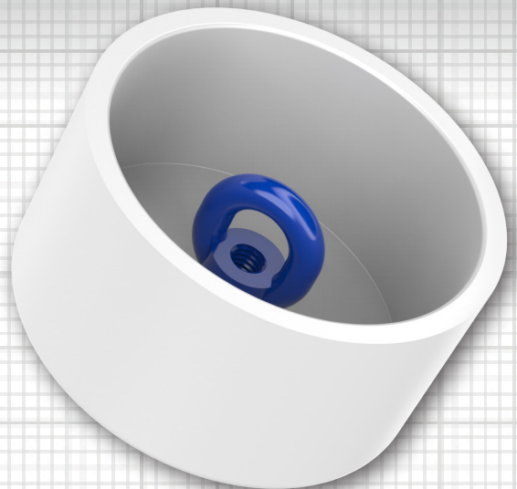
PVC Riser Cap