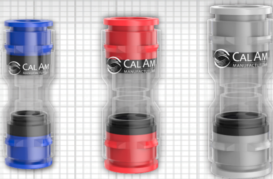
Microduct Straight Couplers