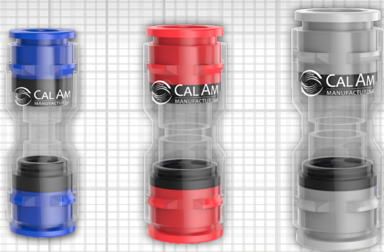
Microduct Straight Couplers